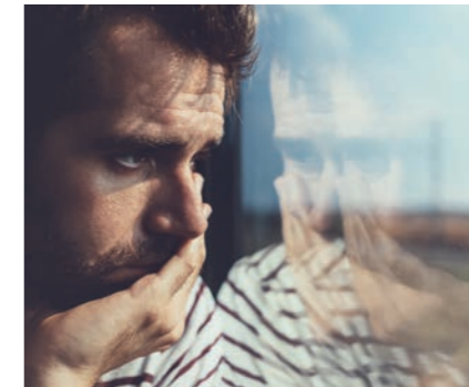
Usually for one person the loss cycle begins, there are 5 stages;

Coming to terms with losing someone who you thought you would be with forever, is one of the most difficult journeys a parent can take.